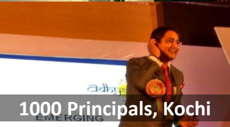
1000 Principals, Kochi