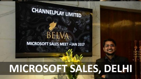
MICROSOFT SALES, DELHI