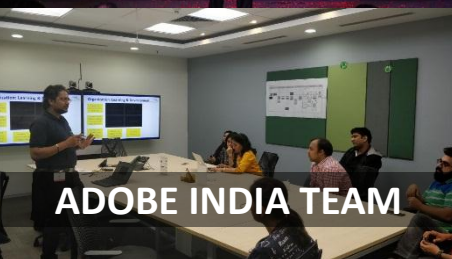
ADOBE INDIA TEAM