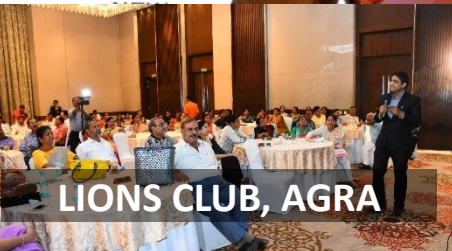
LIONS CLUB, AGRA